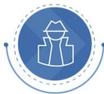
▼ Nation States