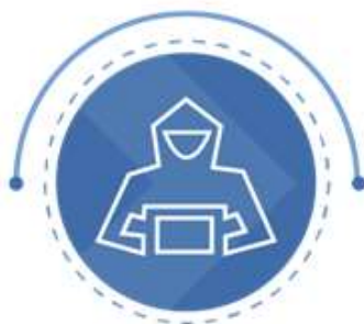
▼ Cyber criminals